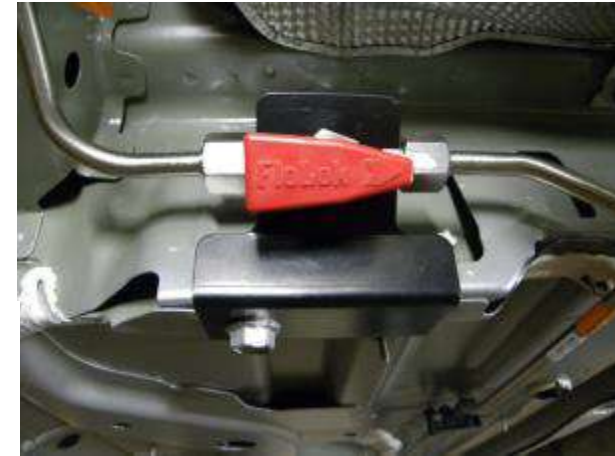
Manual Fuel ¼-Turn Shut-Off Valve ON, allowing fuel flow