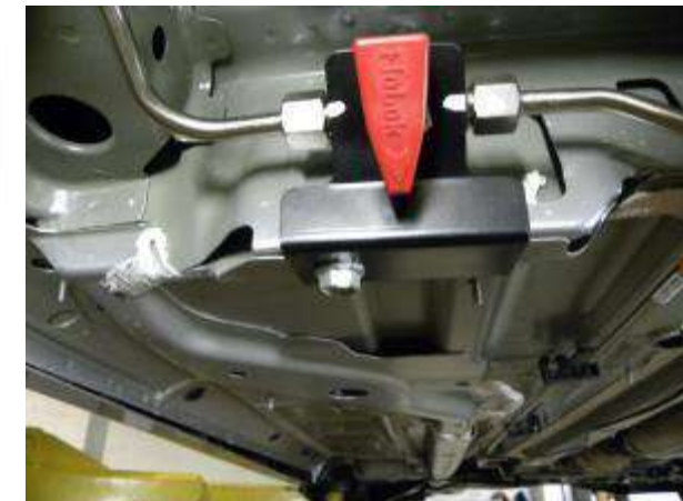
Manual Fuel ¼-Turn Shut-Off Valve OFF, preventing fuel flow